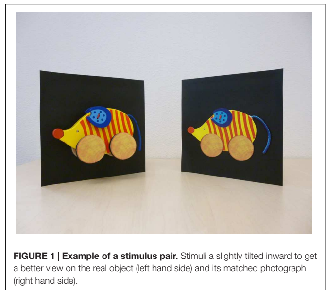
FIGURE 1 | Example of a stimulus pair. Stimuli a slightly tilted inward to get a better view on the real object (left hand side) and its matched photograph (right hand side).

During testing, one experimenter measured infants' fixation times while a second experimenter presented the stimuli. Both